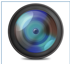
Contex CCD with ALE ensures precision of 0.1% accuracy

HD Ultra scanners are for customers who require a high throughput of documents, great flexibility and unmatched performance.