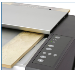
Scan thick originals with automatic thickness control (ATAC)