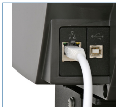
Fastest bandwidth in the industry w/ Gb Ethernet and xDTR2