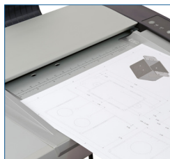
Support your documents with paper feed guides