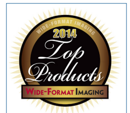
Contex HD Ultra awarded Best Wide Format Scanner for third consecutive year