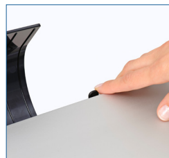
Easily adjust paper pressure to protect fragile documents