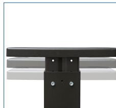
Height adjustable stand for optimal ergonomics